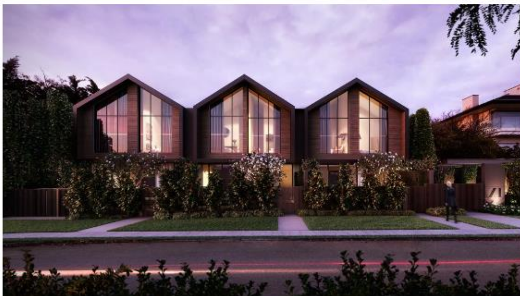
Collection XI townhouses will be built at 11 Mowbray St, Hawthorn East..