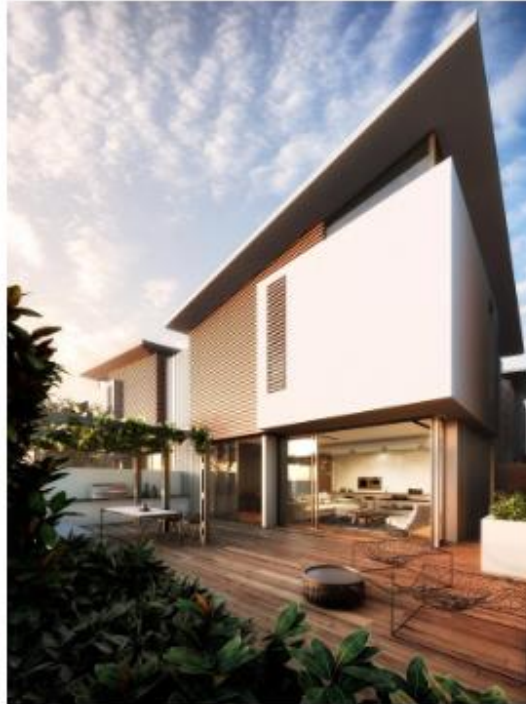
Each townhouse comes with a courtyard for outdoor living.

The steep, sloping site means that residences will be able to drive into the garages, which effectively form a basement level within the site.