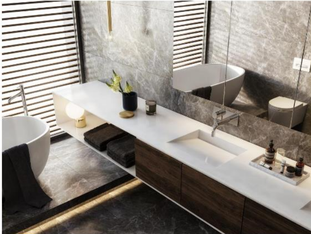
Marble features in the bathrooms at the Collection XI townhouses.

“The houses range from 180sq m to 250sq m of internal space and each one has a large courtyard for alfresco living.”